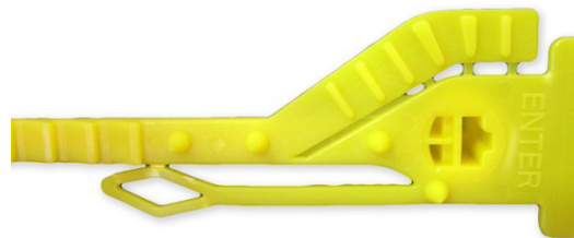
GRIP SEGUR 'POST'